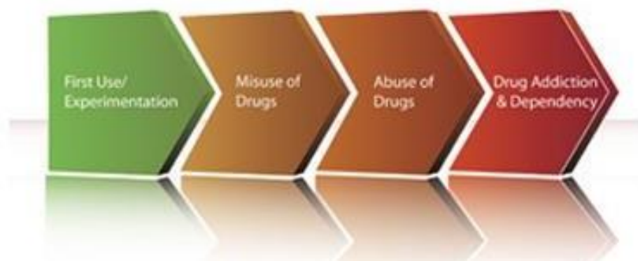
Fig. 1: Pictorial Representation of Stages of Addiction

The person at this stage has lost the ability to choose to use or not use. Using substances has become a way of life. They continue despite the negative consequences and those consequences are occurring more and more frequently. The person may experience physical or psychological withdrawal, cravings, and decreased physical and emotional health.